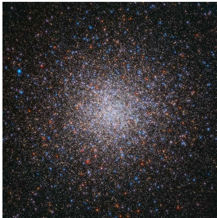
Globular Cluster Messier 2.

Independent of any competing gravity model, however (I'll say it again) we owe it to the spirit of Galileo to build and operate humanity's very first Small Low-Energy Non-Collider . The sooner the better.